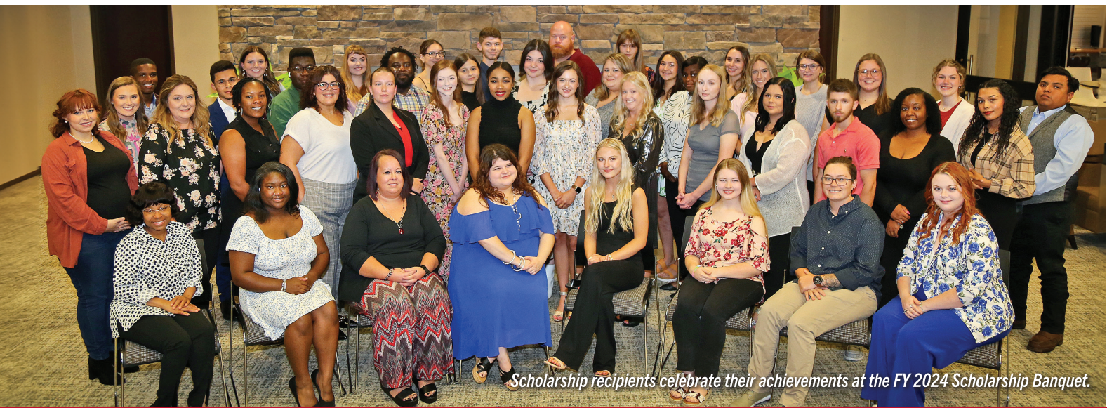
Scholarship recipients celebrate their achievements at the FY 2024 Scholarship Banquet.

THOUSANDS expended for vital equipment and student emergency funds.